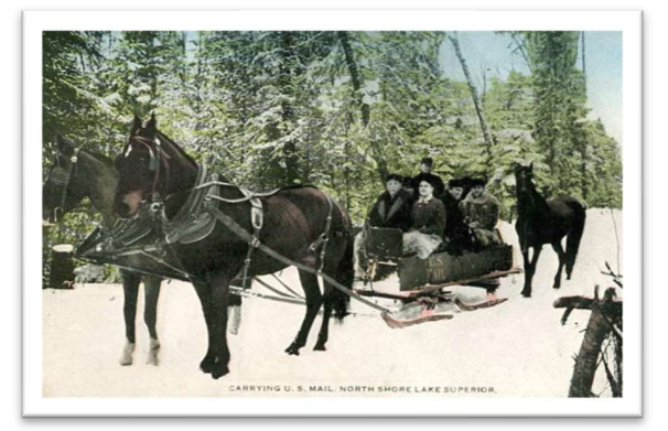
Image right is of the stage sleighs carrying passengers.

From 1883 to 1887 the railroad and mine payrolls, along with money for businesses, were carried by dogsled from Duluth over the road at night. Paddy McDonald, who was about third in line as the world heavyweight boxing champion, had the task of transporting the money. At times as much as $16,000 in gold and silver coins was on the sled, nailed shut inside a wooden box. Oddly, the Duluth & Iron Range Ry continued to pay its employees in cash up until 1906. When the railroad was completed between Two Harbors and Duluth in December 1886, the telegraph line was moved next to the track and the dogsled payroll trips ceased.