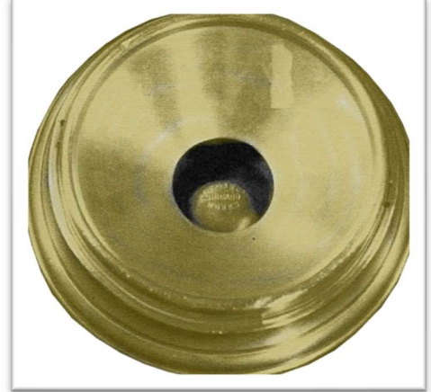
The restored hidden man's spittoon on left, women's spittoon on right.

A man's spittoon such as the one found under the depot floor was of the classical hourglass shape. Most spittoons were commonly made of cast iron with enamel coating or brass or glazed pottery. By contrast a women's spittoon is cylindrical with a tapered top and no lip. Men could aim for the center from a distance as women were expected to hold their dress back and lean over the spittoon directly above it and let gravity do the work.