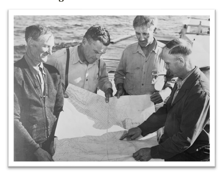
Photo right: The footprint of harbor in November of 1948. Much of the excavating was done by the fishermen. Today's marina expanded on the fishermen's efforts.