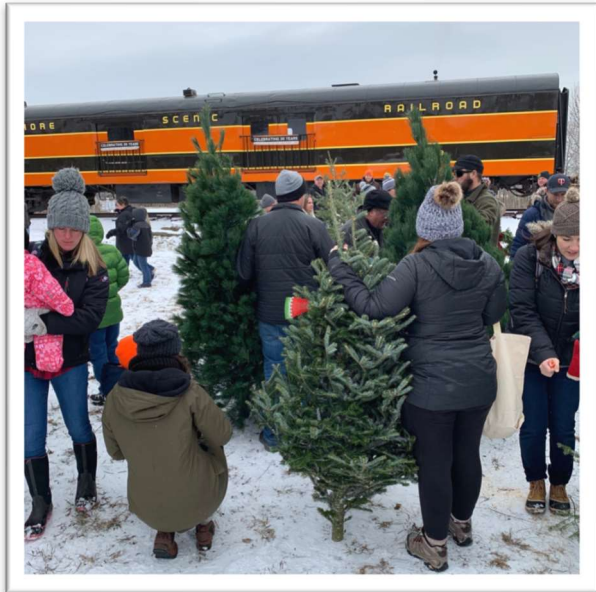
Image: Train ride and excitement of selecting the family Christmas Tree! A magical day for families.

Last Holiday season the NRRS initiated the “Christmas Tree Train” event. Idea behind it was to bring families by train from the Duluth area to the KRHCC site to select a Christmas tree from a broad selection, and shop for wreathes and garland. Trees selected would be wrapped and placed on a flatcar and brought back to the Duluth Depot. Folks could then drive right up to the flatcar and load their tree directly onto their vehicle. The train would run one day only on the Saturday following Thanksgiving and be in KR for a couple hours.